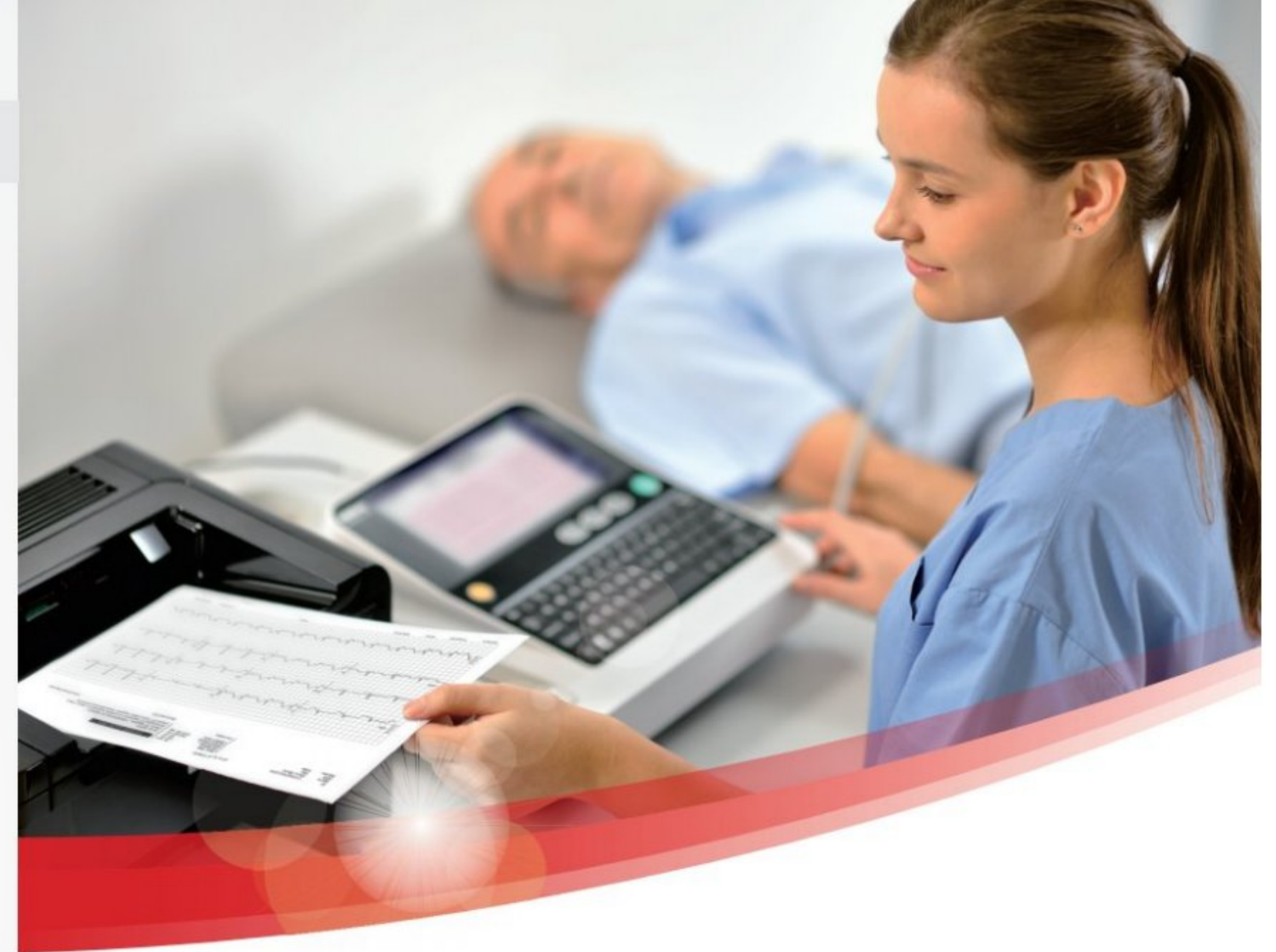
BeneHeart R12 Electrocardiograph